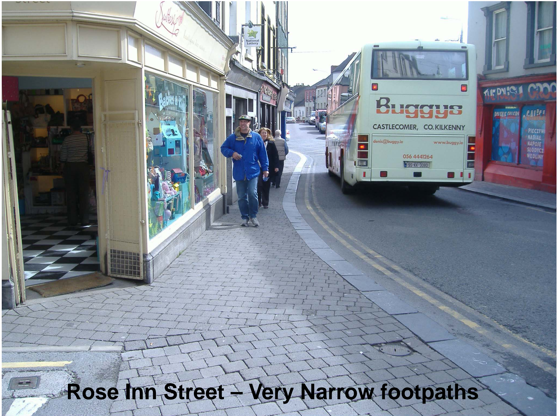
Rose Inn Street – Very Narrow footpaths