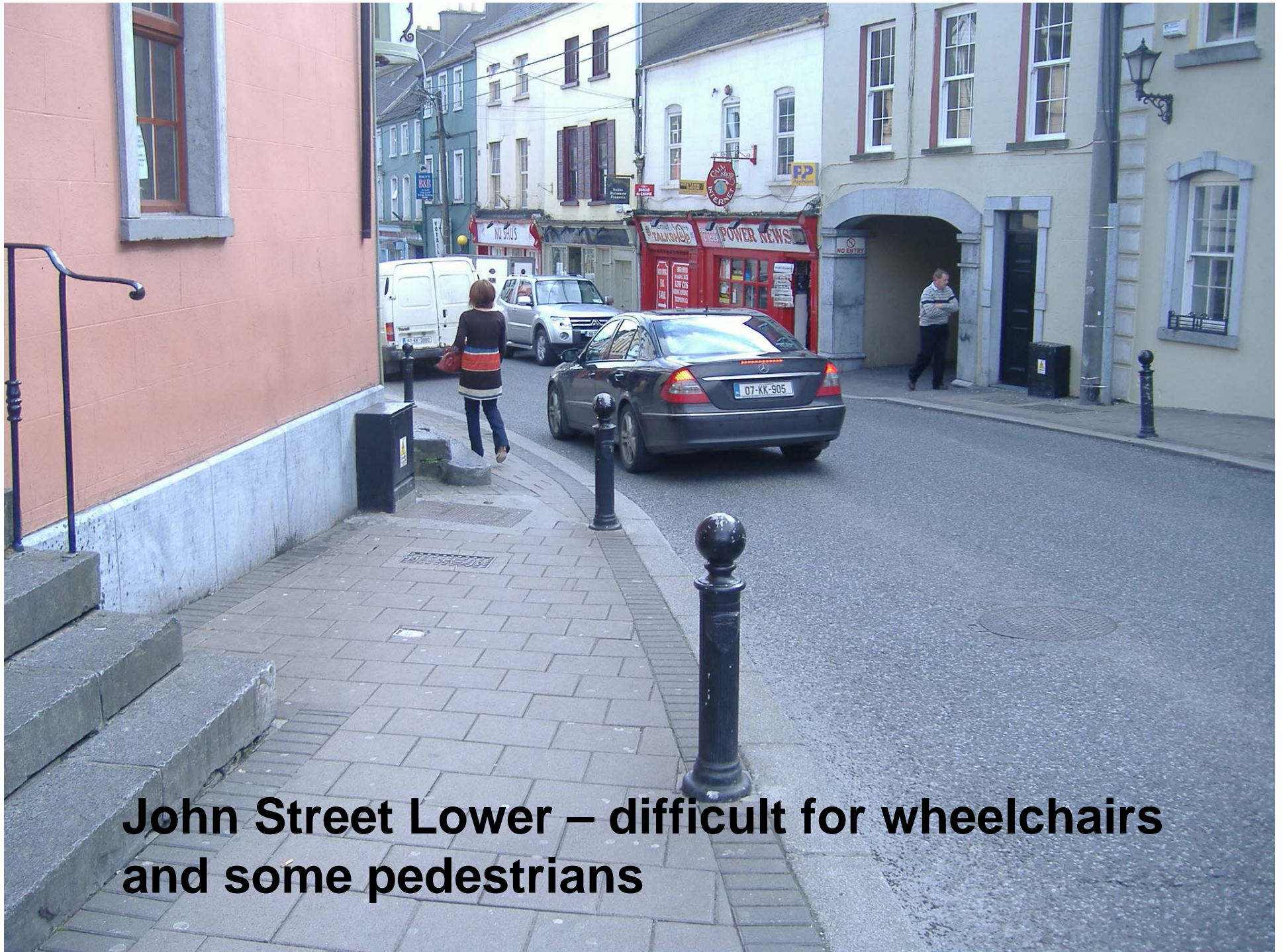
John Street Lower – difficult for wheelchairs and some pedestrians