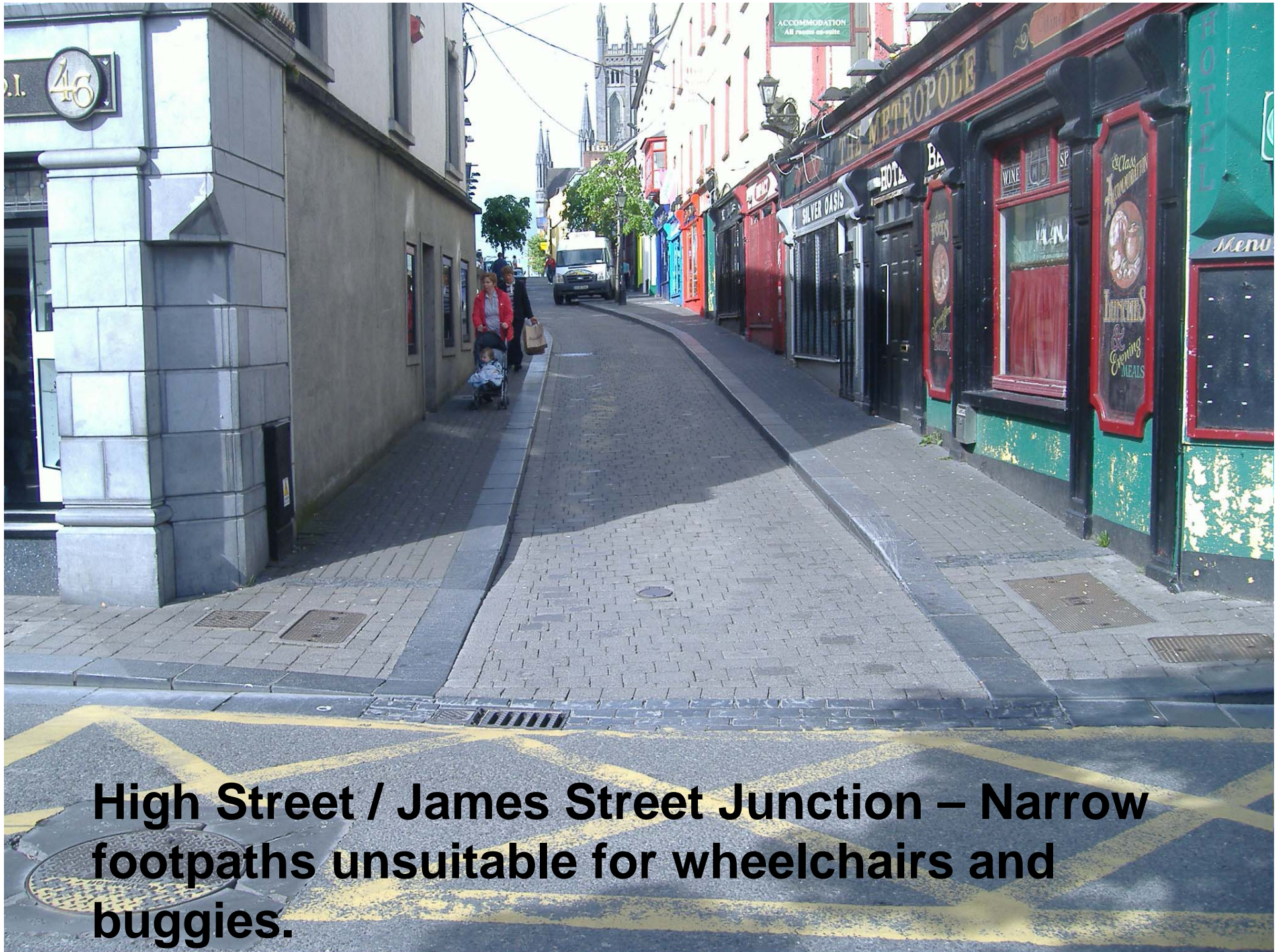
High Street / James Street Junction – Narrow footpaths unsuitable for wheelchairs and buggies.