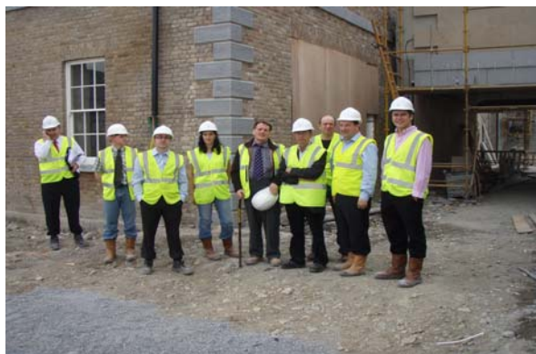
Members of the IAP monitoring committee on a recent visit to the McDonagh Station